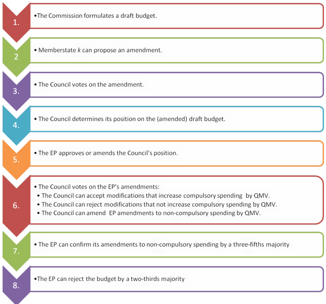
Figure 3: The Old Annual Budgetary Procedure.